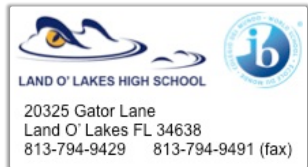
LOLHS International Baccalaureate Diploma

The International Baccalaureate program will present to you at this parent information night about options for your child to attend next year. Presenters will detail the legacy of achievement, the application process for this advanced degree, and how your child can be eligible for the 100% fully funded Bright Futures Scholarship. that makes your child eligible for the 100% fully funded Bright Futures scholarship. Come to this information night to learn more benefits of this program.